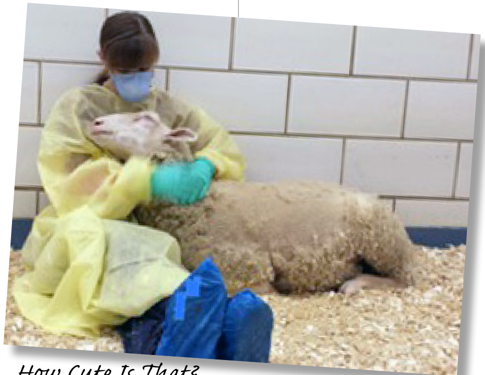
How Cute Is That?